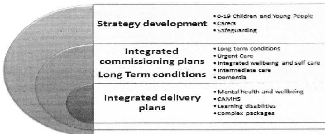
stratification of priorities v3.0